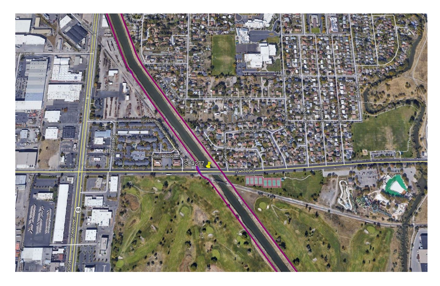
2) Proposed location map